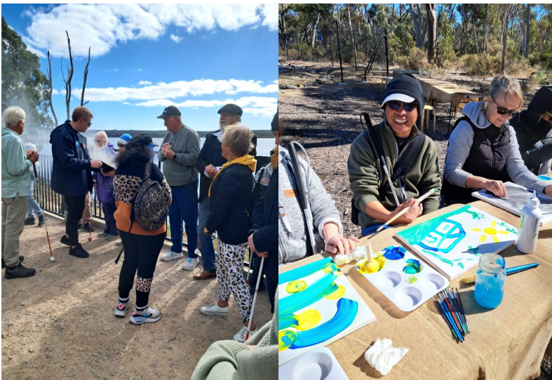
Happy Valley Reservoir