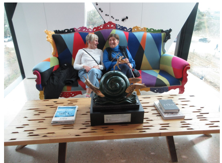
Travel Club: d'Arenberg Cube