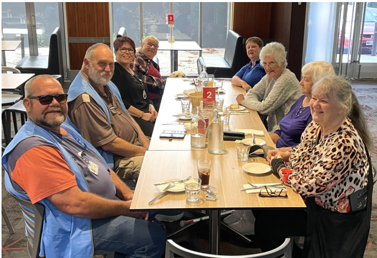
Northern Outreach at McQueen's Tavern