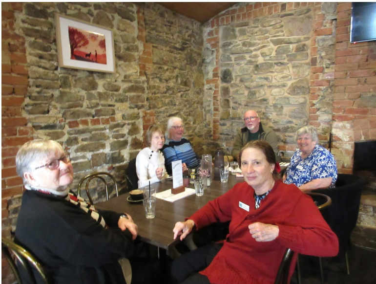
Adelaide Hills Group at Commercial Hotel, Strathalbyn