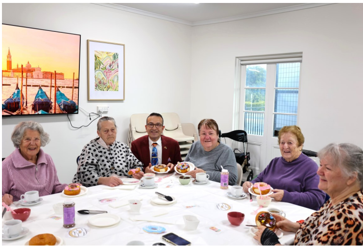
Donut Day at Northern Office