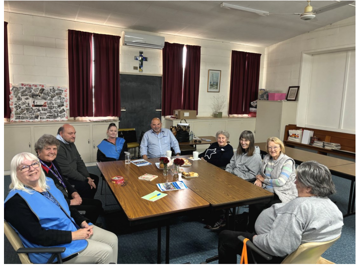
Whyalla Coffee & Chat