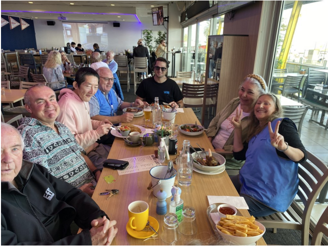
Western Group: Glenelg Surf Lifesaving Club