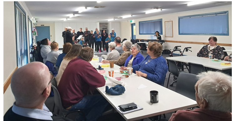
Southern Social Group - Sing Australia