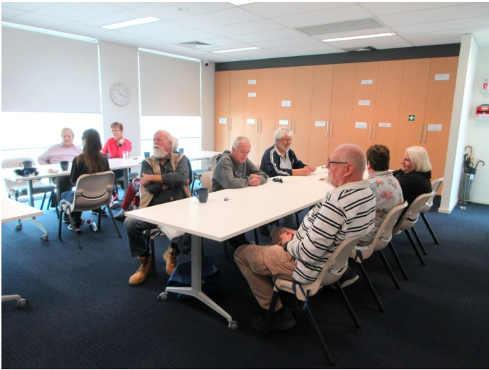
Seniors Group at Campbelltown