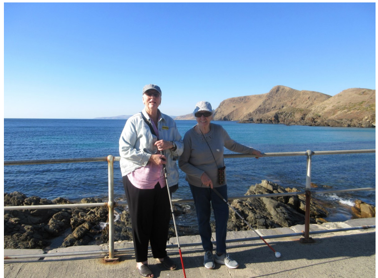
Overnight Trip to Normanville