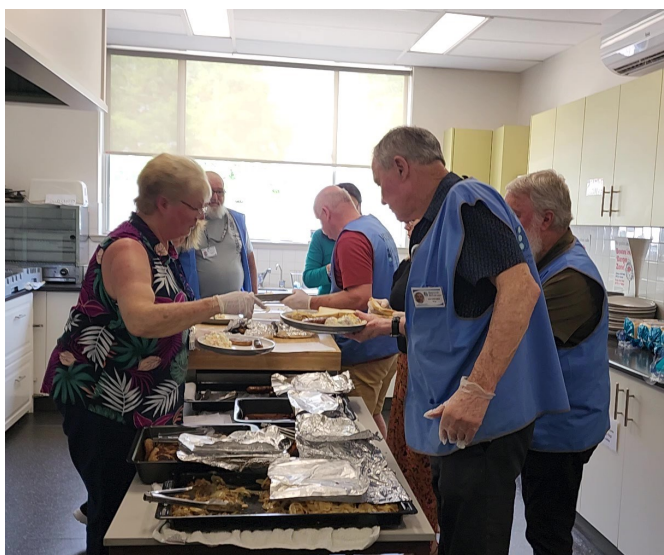
Volunteers serving up meals at the 2022 Oktoberfest bbq