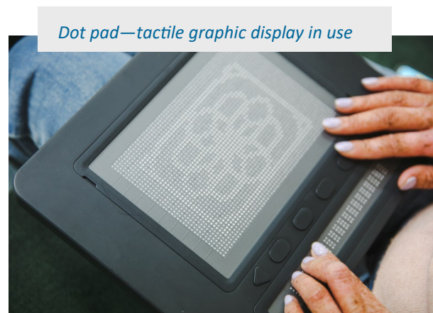
Dot pad—tactile graphic display in use

FOR MORE INFORMATION ON DOT PAD VISIT https://pad.dotincorp.com/