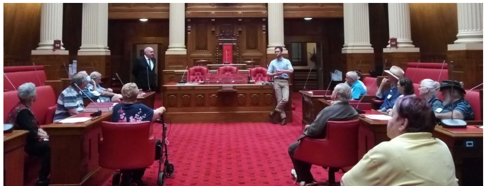
Above: Members experiencing the Parliament House Tour