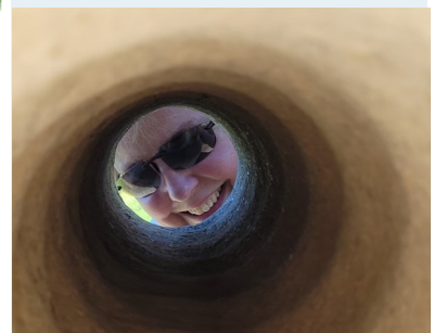
Above: Guess who — having some fun on the Barossa Wine Trip