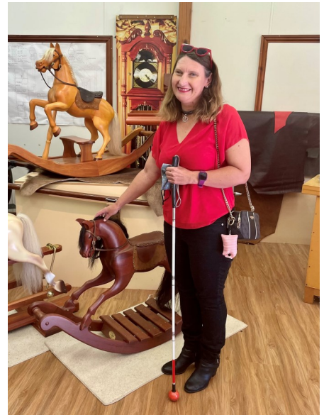
Above: Woodcarvers Haven at Eden Valley