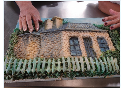
Above: Robe Trip 2022: Members feeling the 3D art piece during the Robe Trip