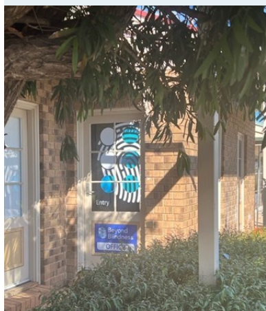
Below: New Campbelltown Office/Social Centre 516 Lower North East Rd Campbelltown