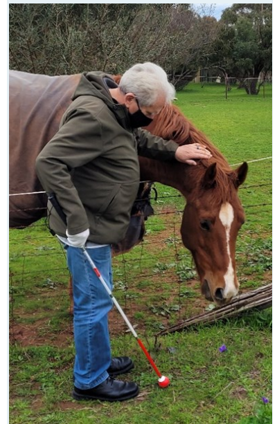
Above: Burra Trip 2022: Members petting a friendly horse