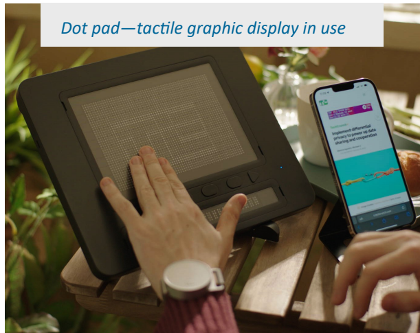
Dot pad—tactile graphic display in use