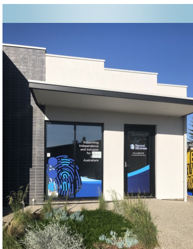
Above: Southern Office: 2/4 Clement Tce Christies Beach &