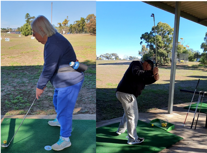
Members of Beyond Blindness practicing their golf swings