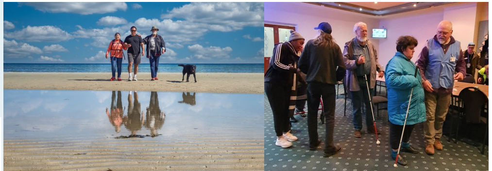
We value all of our Beyond Blindness Volunteers